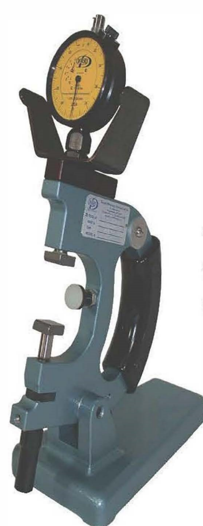
*Shown with #2110-002mm indicator and optional #48502-S bench stand