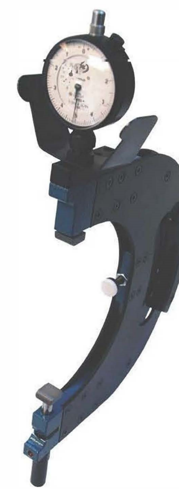
For snap gages with carbon fiber frame 6" diameter and above, add -CF to model number. For example: DS-S2-12376-CF